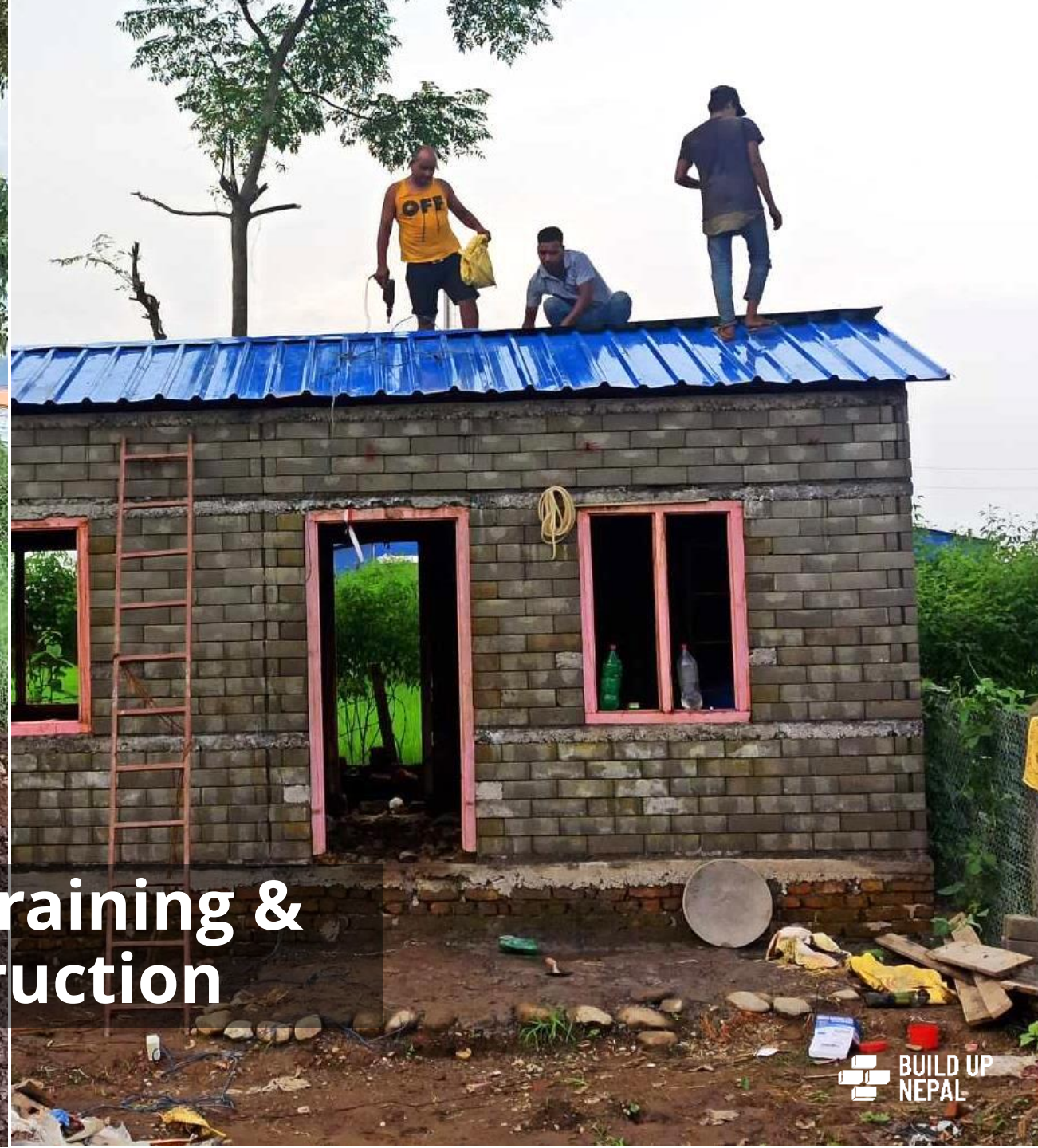
Photos training & construction